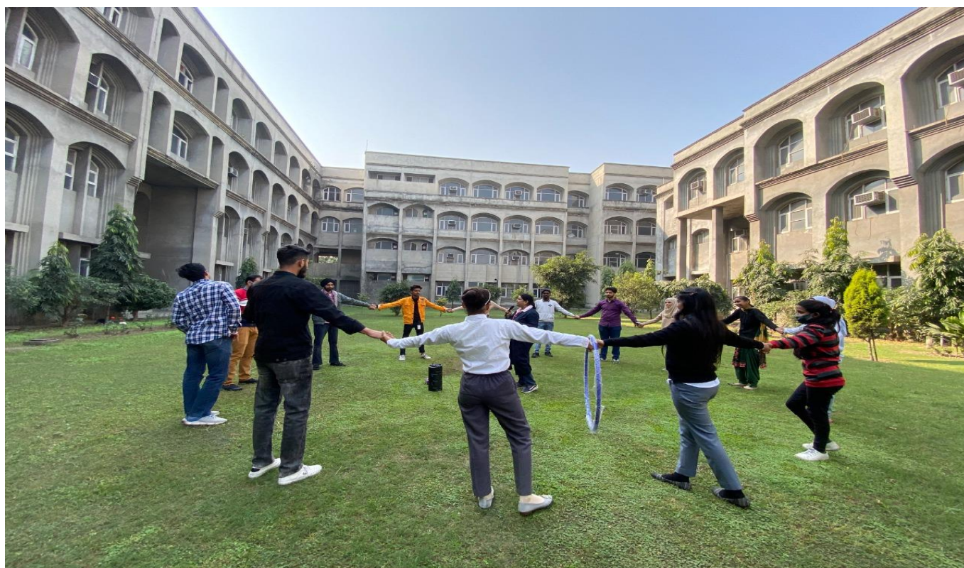
Students enthusiastically participating in the activity