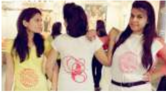
Exhibitions & Project Work