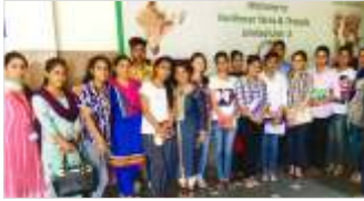
Industrial Visit & Training