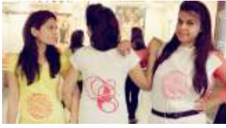
Exhibitions & Project Work