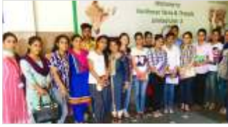
Industrial Visit & Training